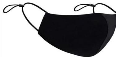
Example of a Plain Coloured Reusable Face Covering

Face coverings are only effective if they are used and handled in the correct way. Safe wearing of face coverings requires sanitising and cleansing of hands before and after touching – including to remove or putting them on. Between each use face coverings must be disposed of in bins or stored safely in individual, sealable plastic bags. Face coverings must never be shared. At the end of each day please ensure disposable face masks are thrown away in a bin and reusable masks are thoroughly washed and dried. Please discuss with your child how to use face coverings correctly before their return.