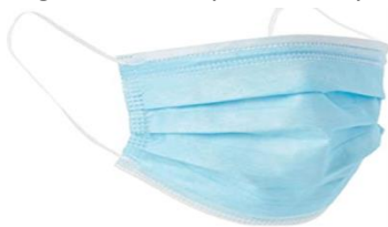
Example of a Disposable Face Covering

At this time it will remain voluntary for students at Tile Cross to wear face coverings in school. This means students in all year groups can choose to wear face coverings in corridors and on the playgrounds at break and lunch. All face coverings must be removed when entering classrooms and will not be allowed to be worn during lessons. Face coverings in classrooms are not required as protective measures are already in place and they will inhibit learning and communication. Face coverings must be plain in colour and can be in the form of a disposable or reusable cloth design. Patterned, personalised or offensive face coverings will not be allowed in school. Face coverings cannot be provided by the school.